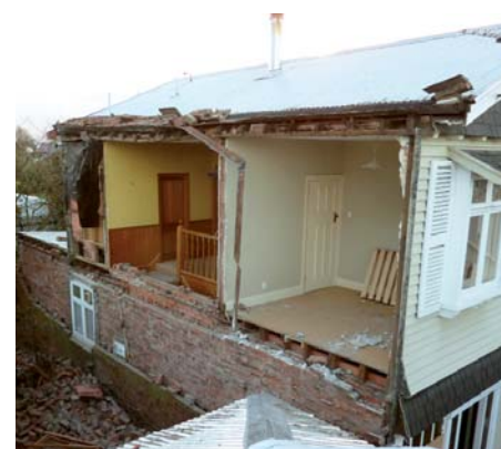
Above: Damage to a house during the magnitude 7.1 Canterbury earthquake, September 2010.

Although there are no standards awarded by completing this course due to the short duration, there are plenty of things to learn by attending. People who are involved in responding to Civil Defence emergencies should consider attending the two day Core Skills course which covers additional topics such as using radios; health and safety; and the Coordinated Incident Management System, instead of this introductory course.